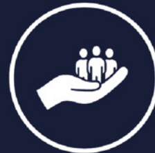
Health and Safety